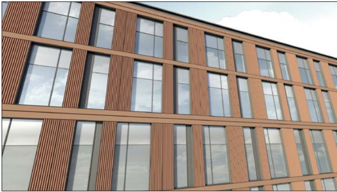
Detail of the new building façade.

There is a great deal of outreach involved in designing and planning to build a new UCSF facility. The UCSF RAB at ZSFG is no exception, and its location on the historic ZSFG campus has meant the involvement of some special groups. Over the last few months the project team has presented to numerous organizations, including the SF Health Commission, the SF Arts Commission, and the Historic Preservation Commission. They have also given informational presentations at neighborhood association meetings, including Potrero Boosters and Calle 24, and at the quarterly ZSFG Community Meetings.