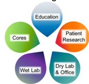
Our Design Groups

Please join us at the Town Hall on October 24 to learn more about DD progress and see updated renderings of the new building!