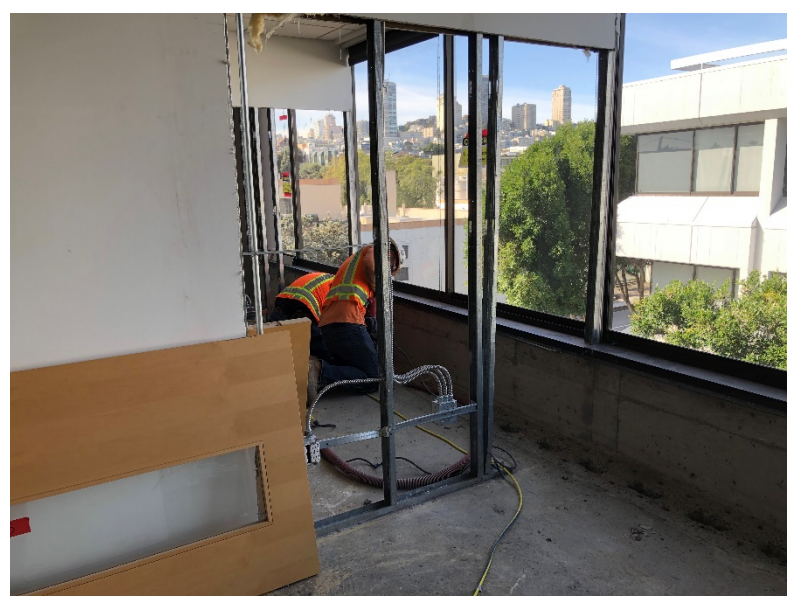
Installation of the perimeter collector beam.