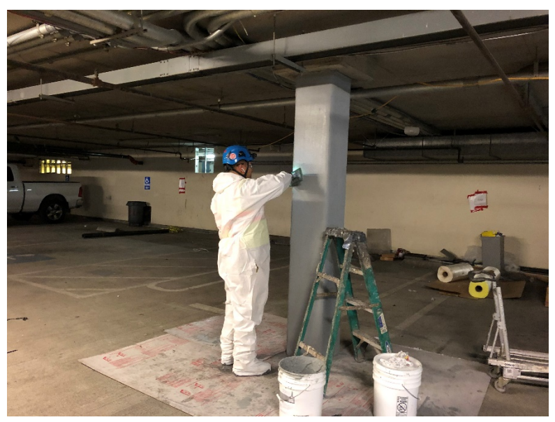
Carbon fiber wrap installed on columns in order to make stiffer.