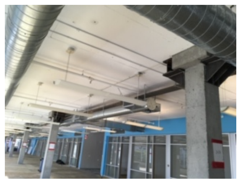
Open Office with each column capital installed.