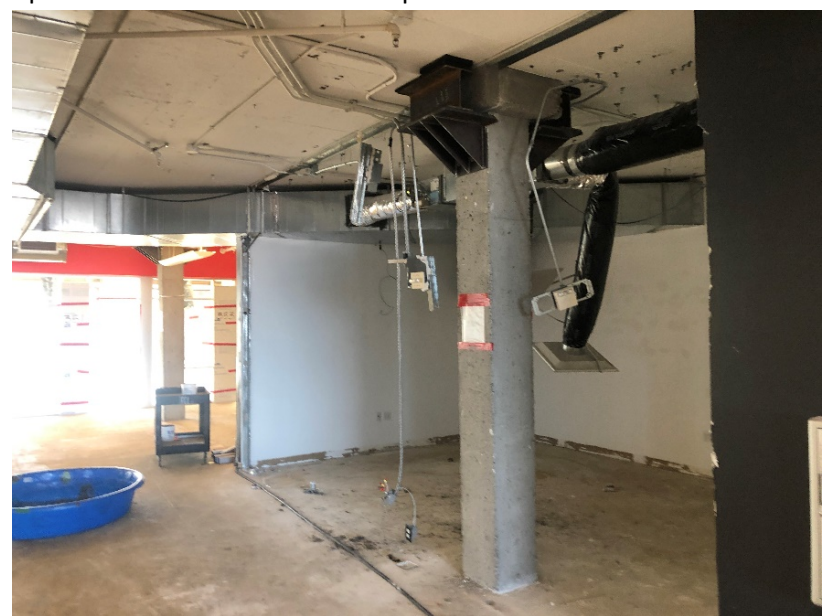
Coordination of column capitals and utility systems.