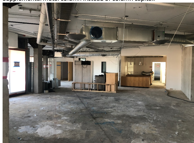
3<sup>rd</sup> Floor Gathering Area progress.