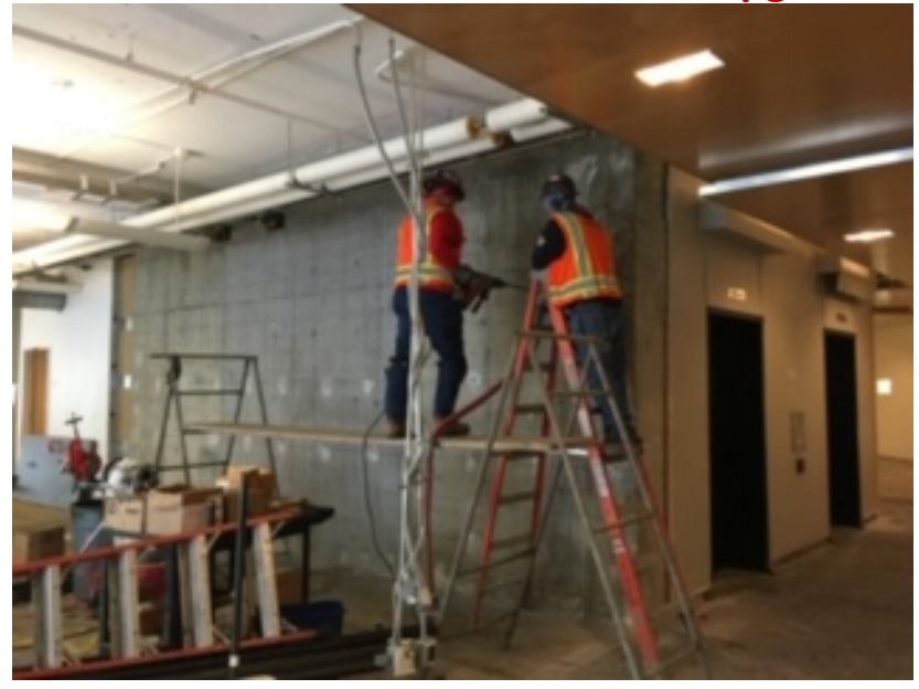
Installing dowels and rebar in existing building sheer wall.

Photos from 2/12/20 – Structural Upgrades