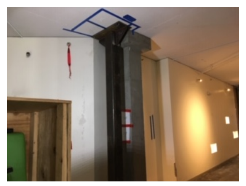
Supplemental metal column instead of column capital.