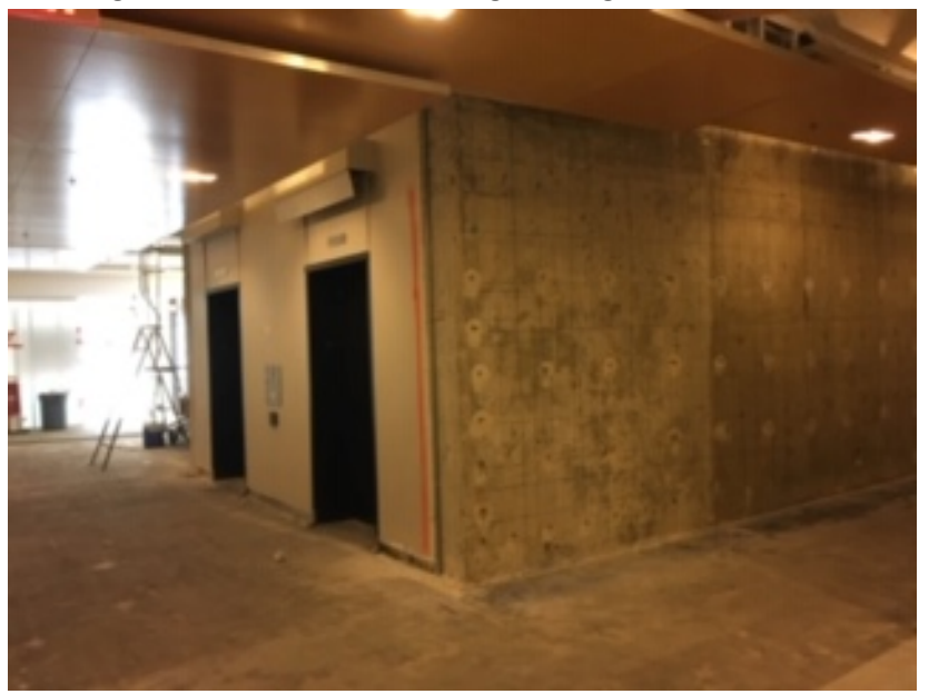
Existing sheer wall prepared to accept new concrete sheer wall.