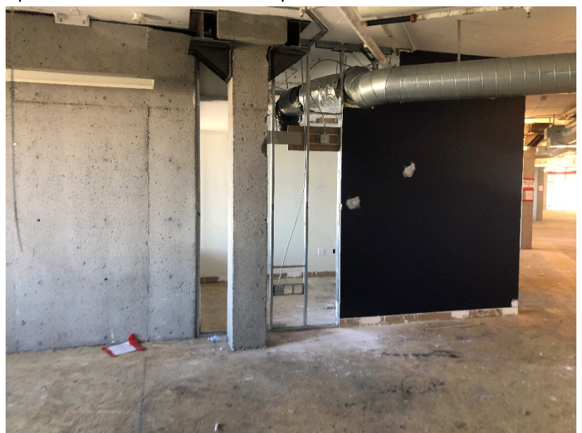
Coordination of column capitals, walls and utility systems.