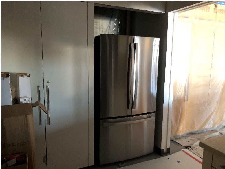
Appliances installed in each Break Room