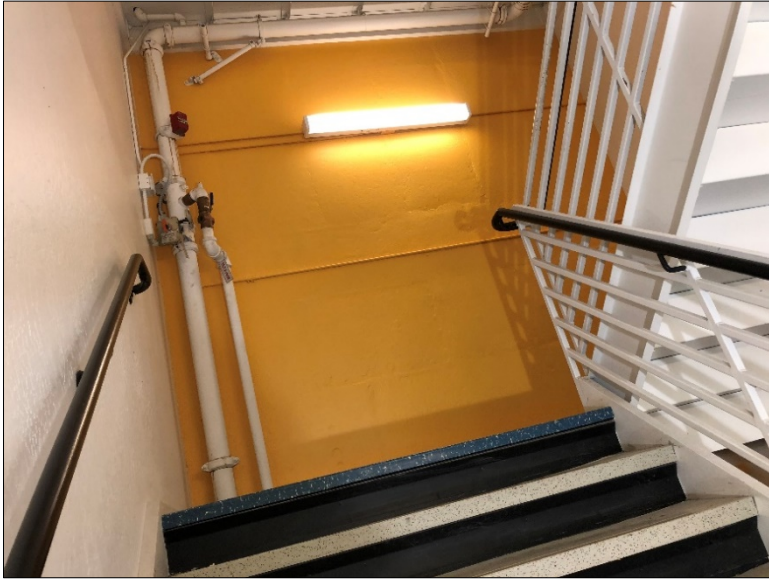
Painted highlight wall in stairwell, which used to be bright red