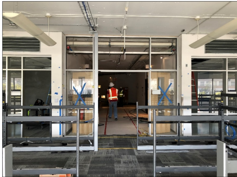
New storefront entrance at south wall of Floors 2 and 3