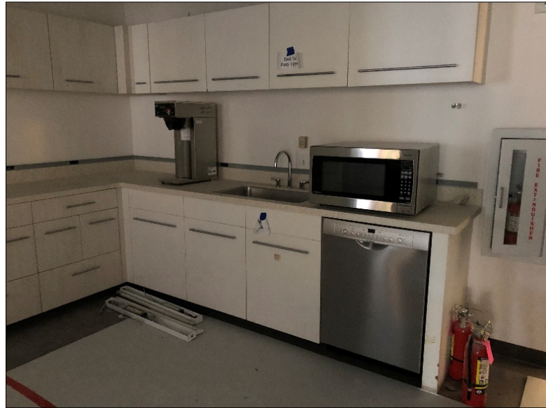
Appliances installed in each Break Room