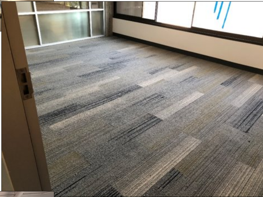
Contrasting carpet at office, with highlight wall paint