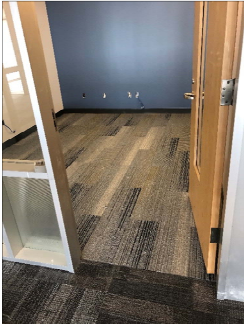
Contrasting carpet at office with highlight wall paint