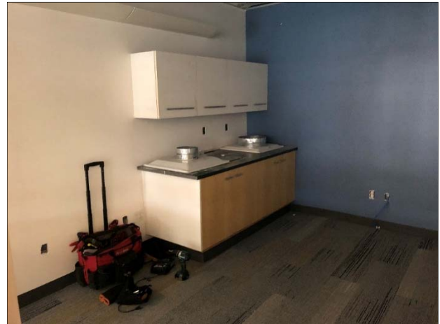
Casework in Copy Room