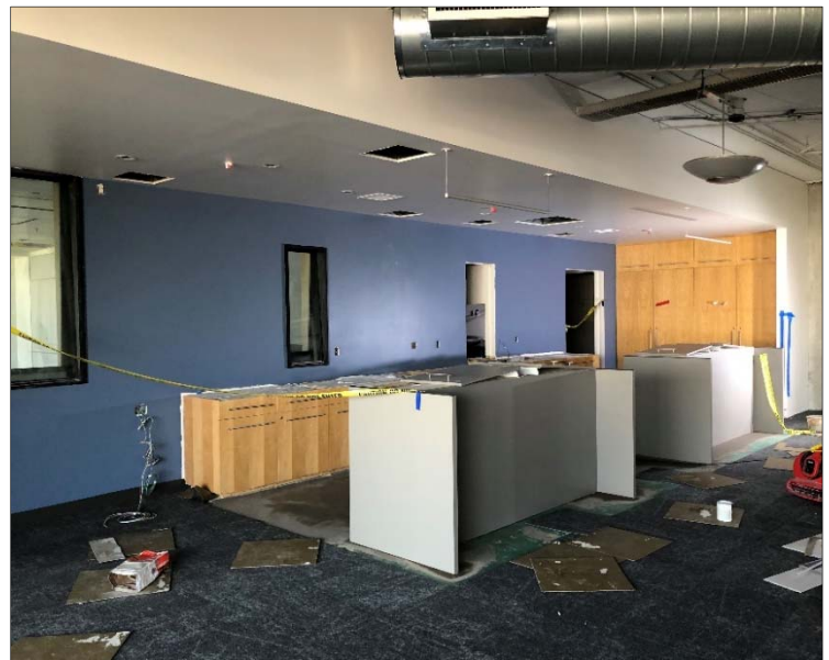
Casework, island counters and pendants