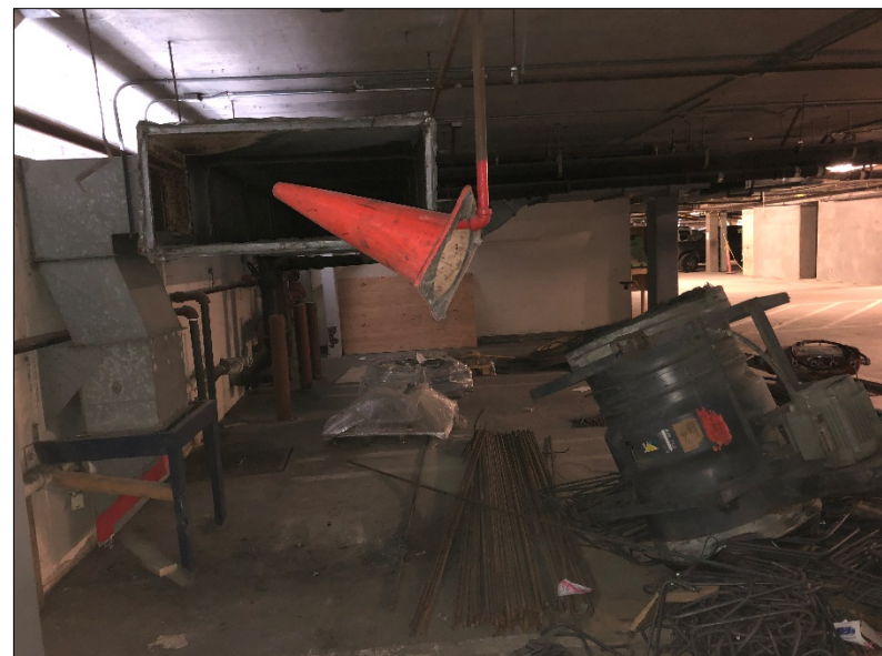
Mechanical air handling unit replacement.