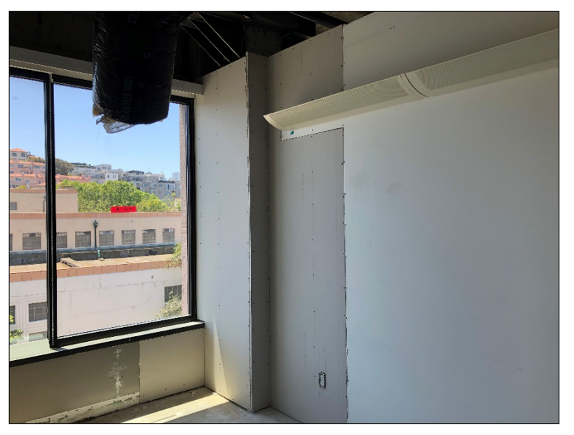
New wall patch at structural upgrade.