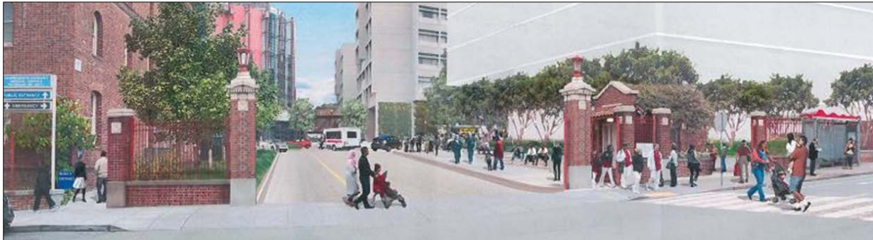
Rendering from planning documents.

Site logistics planning and coordination