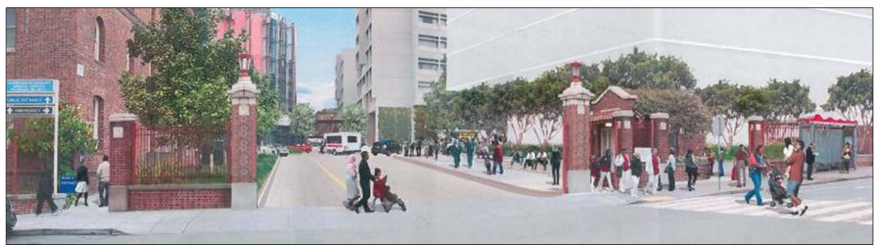
Rendering from planning documents.